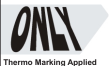
Thermo Marking Applied