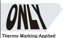
Thermo Marking Applied

1) Clean Surface: Clean intended application area thoroughly. All loose particles, sand, dust, etc. must be removed. Utilize a power blower or compressed air if available, otherwise sweep completely.